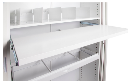
GG09PS Roll Out File Shelf