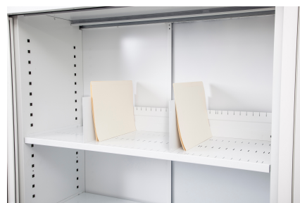
GG09SLOT Slotted Shelf + GS7D Dividers