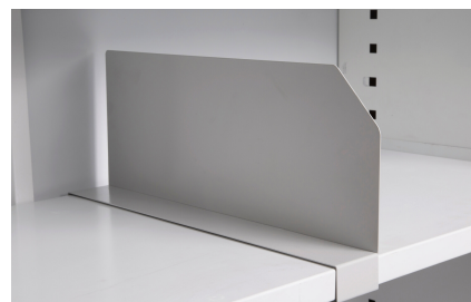
GSD6 Clip On Divider