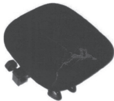
Seat with mechanism