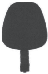
Back with bellow